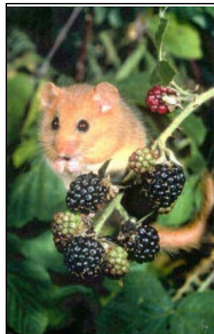
Dormouse feeding on blackberries

do not occur in either Scotland or Northern Ireland. Dormice occur mainly in the southern counties, especially Kent, Sussex, Devon and Somerset. They are widespread in Kent's semi-natural ancient woodlands, in both east and west Kent.