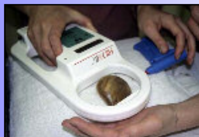
Identifying a dormouse using a chip reader