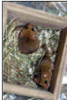
Dormouse pair in nest box

Underweight or sick animals are moved into a permanent building where they are provided with a nest box within their cage and low heating. An underweight animal not suitable for reintroduction would have a weight of less than 20g and its chances of surviving hibernation would be greatly reduced.