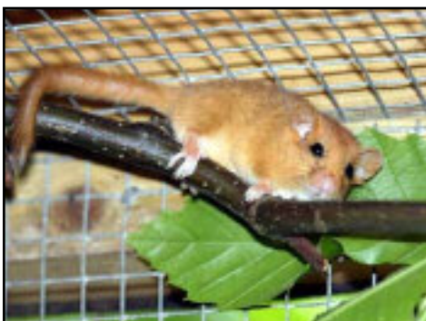
Dormouse in pre-release cage

together. Release cages containing adult males should be placed at least 100m apart to avoid territorial aggression on release 1 . For the first two to three weeks after reintroduction all cages are supplied on a daily basis with fresh food. This is done during the daytime to avoid disturbing the dormice. A small amount of leafy branches are placed on top of release pens to provide extra shade and protection from predators.