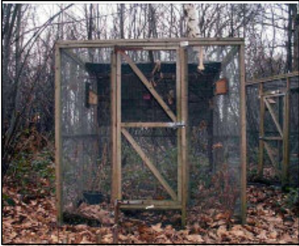
Outdoor dormouse enclosure

All hazel dormice used for captive breeding at Wildwood are housed in outside enclosures which are not accessible to the general public. This is to avoid unnecessary disturbance, especially during hibernation.