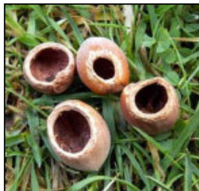
Dormice leave distinctive toothmarks on hazelnuts

Released individuals can be recognised by scanning for implanted microchips. Monitoring can also be carried out by identifying field signs of dormice such as remains of food and nests. Dormice open nuts in a characteristic manner not used by any other small rodents. The surface of the cut rim appears smooth or has very faint tooth marks running around it, following the edge of the hole 1 .