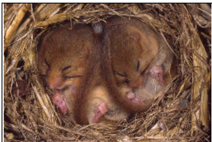
Dormice asleep in nestbox

Total population size can only be assumed, based upon results from trapping, nest box surveys and reintroduction numbers. Dormouse distribution in Britain has only been determined recently, mainly based on two surveys; the