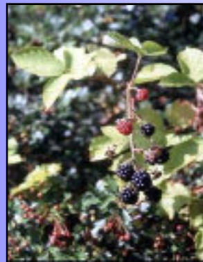
Seasonal fruit of blackberries

During the spring, summer and autumn seasons, dormice require an active diet of dry feed and fresh fruit. As their diet in the wild is dependent upon not only season but food availability, a wide range of seasonal fruits and flowers are offered. The dry food consists of equal parts of hamster mix, wild bird seed and parrot seed, placed in a food hopper. A second food hopper is required for pieces of fresh fruit, usually consisting of apple, banana, orange, melon or carrot. In addition to this standard diet they get treats of seasonal fruits such as rowan berries, blackberries, chestnuts, green hazelnuts, rosehip and elderberries as well as native flowers including honeysuckle, elder, rowan and hawthorn. Prosecto insectivore supplement is sprinkled on top of the dry mix once a week.