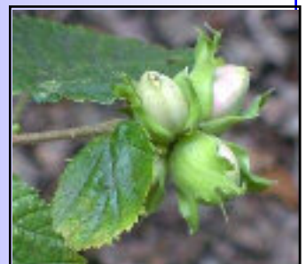
Seasonal fruit of hazelnuts

Water is provided in bowls placed on the floor but water bottles are being trialled as this would simulate wild conditions more accurately.