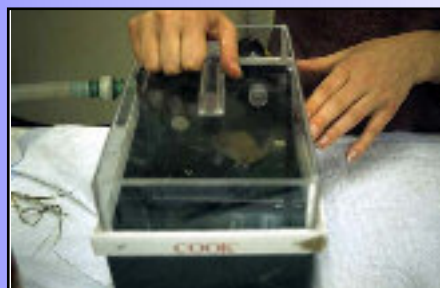
Anaesthetising before inserting chip subcutaneously

All dormice are fitted with 8mm Pet-ID microchips during preparation for release. The dormouse is anaesthetised first and the microchip is then inserted subcutaneously in the side of the abdomen. When a chip reader is passed over this area, a particular dormouse can be identified. These transponders should be re-checked during the week prior to release, to ensure they are working.