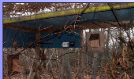
Food hoppers inside enclosures