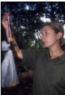
Weighing a dormouse

It is particularly important to maintain blood lines, thus expanding the gene pool and producing more unrelated individuals suitable for release. Each individual when born is allocated a stud book number (provided by the studbook keeper at Paignton Zoo) and a local ID which is allocated by the breeder.